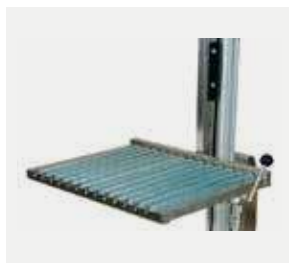
Roller Platform with side feeding and locking.