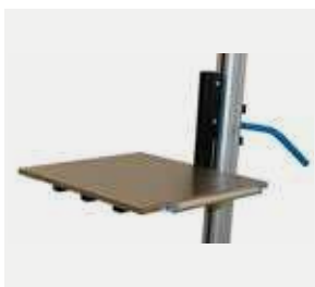
Platform with edge rolls.