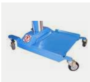
Platform for Crates.

For more information please contact your sales representative.