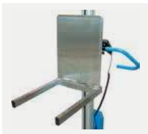
Fork for crates, with fold- down platform.