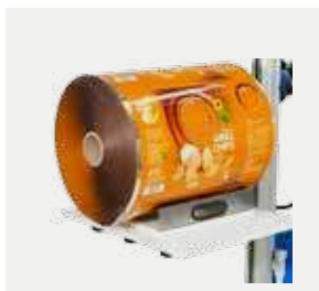
Platform with V-block.