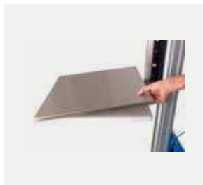
Platform Protection, stainless.