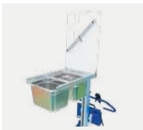
Folded Platform for containers.