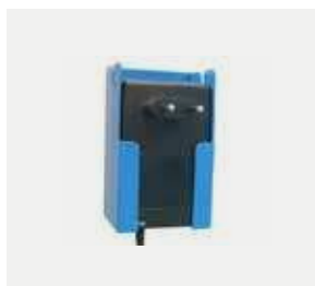
Holder for battery charger.