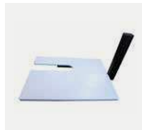
Platform with recess.