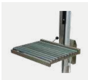
Roller Platform with front loading and locking.