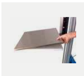
Platform Protection, stainless.