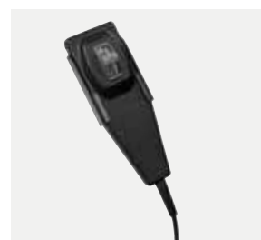
Stepless remote control.

One of our main strengths is that we also develop and manufacture accessories in accordance to your specifications.