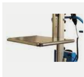
Platform with 3 rollers.