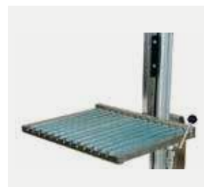
Roller Platform with side feeding and locking.