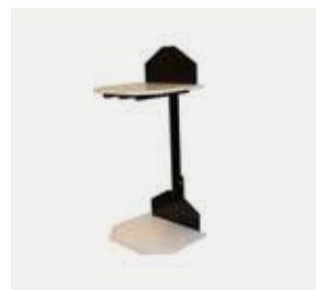
Dual Platform for archiving.