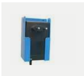
Holder for battery charger.