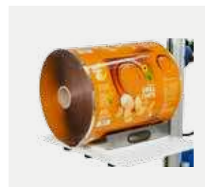
Platform with V-block.