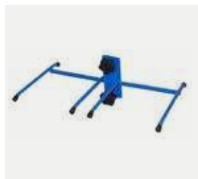
Waste Bag holder, dual.