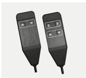
2 and 4-Button Remote Control. 4-button=dual speed.