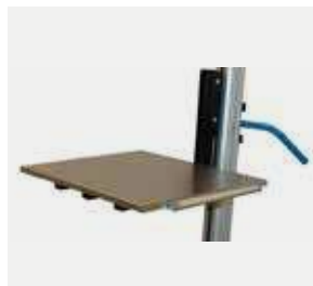
Platform with edge rolls.