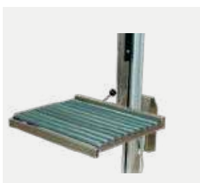
Roller Platform with front loading and locking.