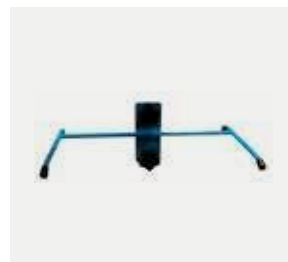
Waste Bag holder, single.